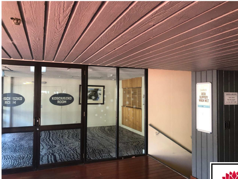
EAST/WEST VIEWS OF ALPINE HOTEL